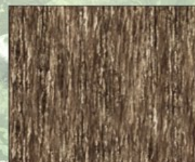
Fabric G 38518-200 Quilt 1: 5/8 yard Quilt 2: 2/3 yard

Kit requirements based on a minimum of 15 yards per bolt.