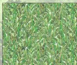
Fabric E 38522-777 Quilt 2: 3/8 yard