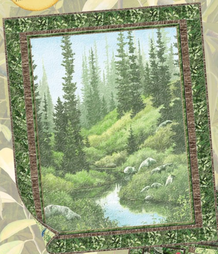
Quilt 1 Approximate Size: 28.5" x 34.5"