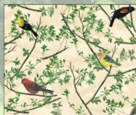
Fabric C 38521-179 Quilt 2: 3/4 yard (Piecing) 3 yards (Backing)