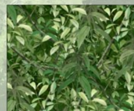
Fabric F 38523-777 Quilt 1: 3/8 yard Quilt 2: 1 yard

Q555-122-555 "Nature's Song" Project Sheet - Pack of 12