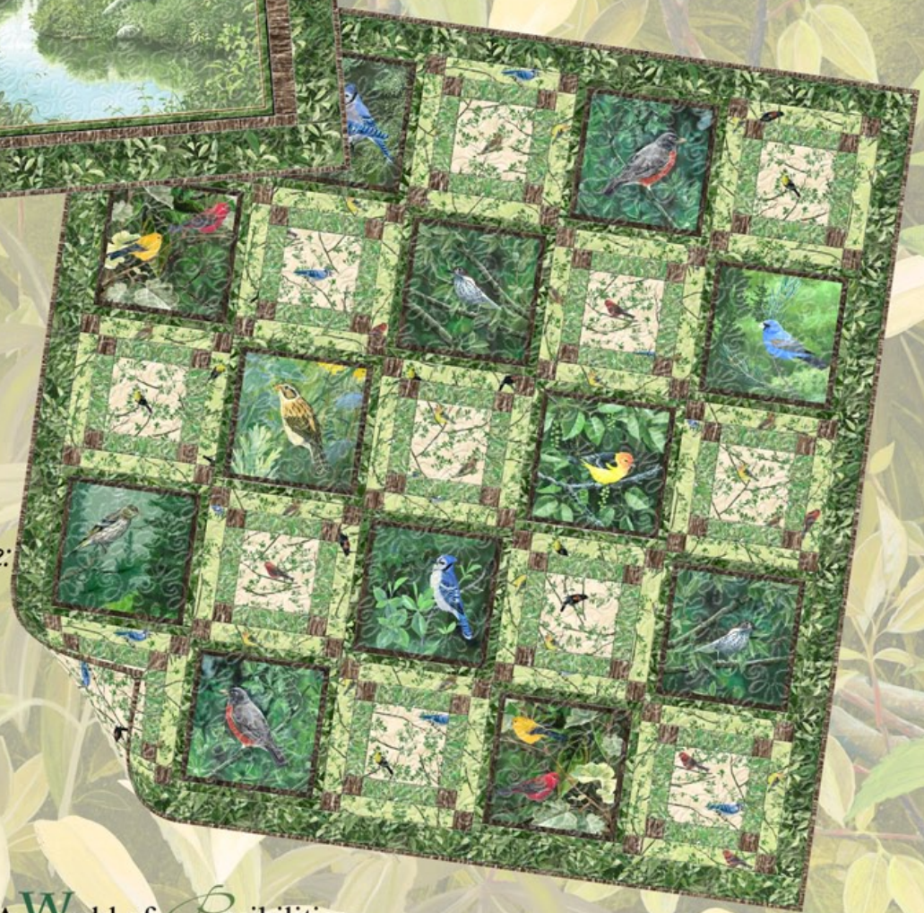
Quilt #2 Approximate Size: 43.5" x 43.5"