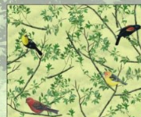
Fabric D 38521-779 Quilt 1: 1 1/4 yards (Backing) Quilt 2: 1/2 yard