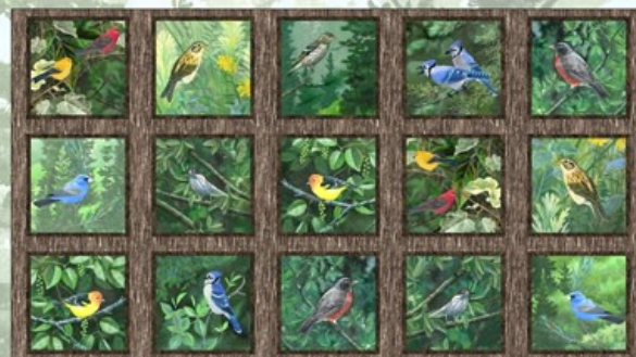
Fabric B 38520-274 Quilt 2: 1 repeat (2/3 yard - 24" x 44")