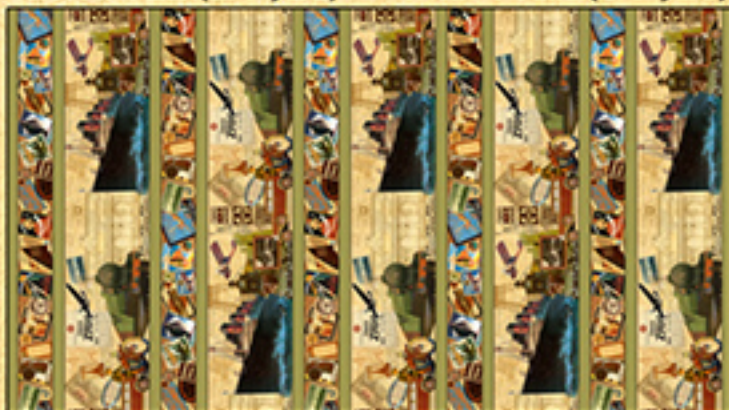
Fabric B 85502-724

WH1: 1 Panel(2/3 yard) WH2: 1 Panel(2/3 yard)