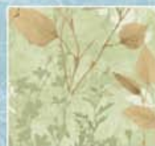
FABRIC H: 42314-772 3/4 YARD