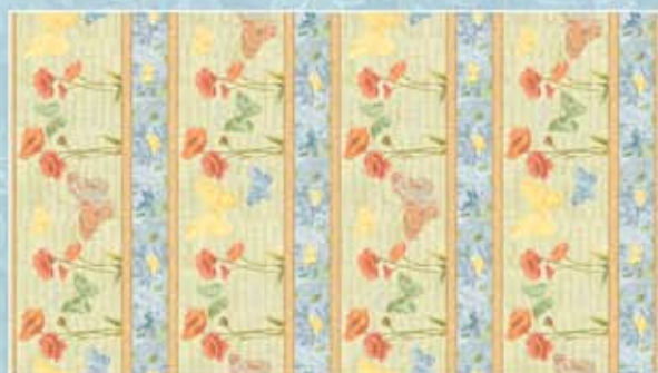
FABRIC B: 42311-758 2/3 YARD