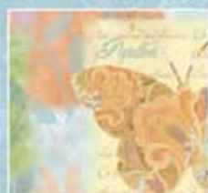
FABRIC C: 42312-578 3/4 YARD