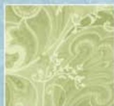
FABRIC F: 42313-777 1/4 YARD