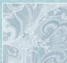
FABRIC D: 42313-444 2/3 YARD