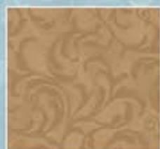
FABRIC I: 42315-222 1 1/4 YARDS (INCL. BINDING)