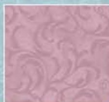
FABRIC J: 42315-600 1/4 YARD