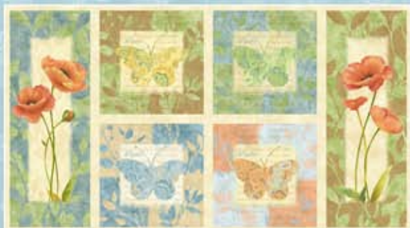
FABRIC D: 42310-148 1 PANEL (2/3 YARD)