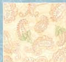
FABRIC K: 42316-168 1/4 YARD