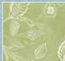
FABRIC N: 42288-771 1/2 YARD