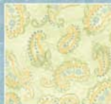
FABRIC L: 42316-747 P: 1/4 YARD B: 3 2/3 YARDS