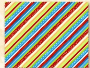
Fabric I (includes binding) 77208-437 N-7/8 yard T-1 yard

All thumbnails shown at 15% of actual size