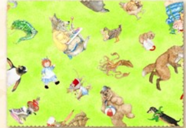
Fabric C (backing only) 77203-724 N-3 yards T-5 yards