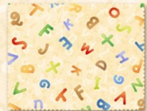
Fabric G 77207-143 T-1/3 yard