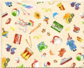
Fabric D 77205-137 N-3/4 yard T-3/4 yard