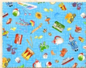
Fabric E 77205-437 N-3/8 yard T-3/8 yard