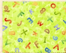
Fabric H 77207-743 N-3/8 yard T-3/8 yard

Kit requirements are based on a minimum of 15 yards per bolt.