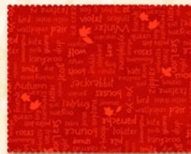
Fabric F 77206-333 N-2/3 yard T-1 1/3 yards