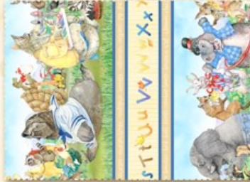
Fabric B 77202-427 T-2 yards