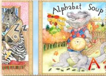
Fabric A 77201-425 N-1 Panel T-1 Panel