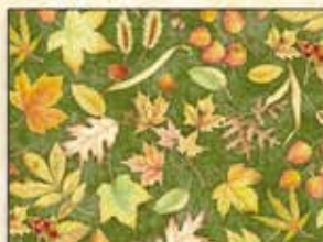
Fabric C 54753-758 Q - 1/3 yd + 1 1/4 yds (backing) P - n/a