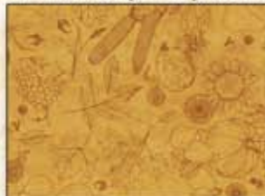
Fabric F 54756-888 Q - 1/3 yard P - 1/4 yard