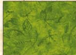
Fabric H 54757-777 Q - 1/4 yard P - n/a