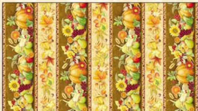
Fabric B 54755-258 Q - n/a P - 5/8 yard (Additional ydg. required for identical pattern placement.)