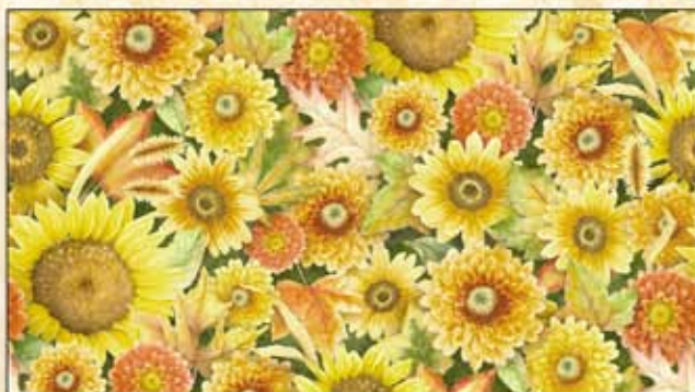
Fabric A 54751-758 Q - 5/8 yards P - n/a