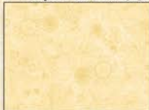
Fabric E 54756-582 Q - 1/2 yard P - 1/2 yard