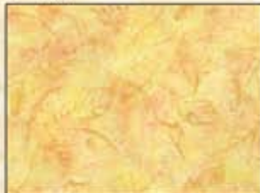
Fabric G 54757-588 Q - 1/2 yard P - n/a