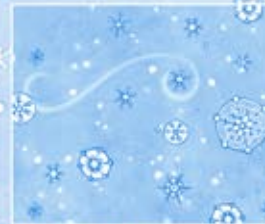
Fabric H Q1699-54764-441 BQ: 1 1/2 yards NQ: 3/4 yard