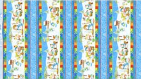
Fabric B Q1699-54759-147 BQ: 2 1/4 yards NQ: 2 yards