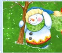
Fabric E Q1699-54761-715 BQ: 1/2 yard NQ: 1/3 yard