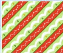
Fabric G Q1699-54763-371 Includes Binding BQ: 7/8 yard NQ: 3/4 yard