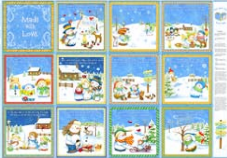
Fabric A Q1699-54758-417 BQ: 1 panel (30") NQ: 1 panel (30")