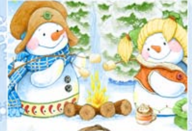
Fabric C Q1699-54760-147 BQ: 2/3 yard NQ: 3/8 yard