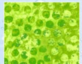
Fabric K Complements Q1875-31072-757 BQ: 1/4 yard NQ: 1/4 yard

Kit requirements based on a minimum of 15 yards per bolt.