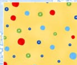
Fabric J Q1699-54765-534 BQ: 1 yard NQ: 1/2 yard