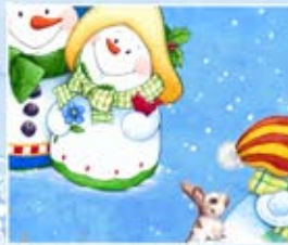
Fabric D Q1699-54761-415 Backing Only BQ: 5 1/2 yards NQ: 3 1/2 yards