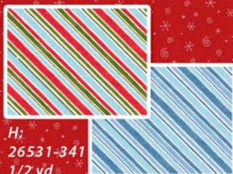
H: 26531-341 1/2 yd