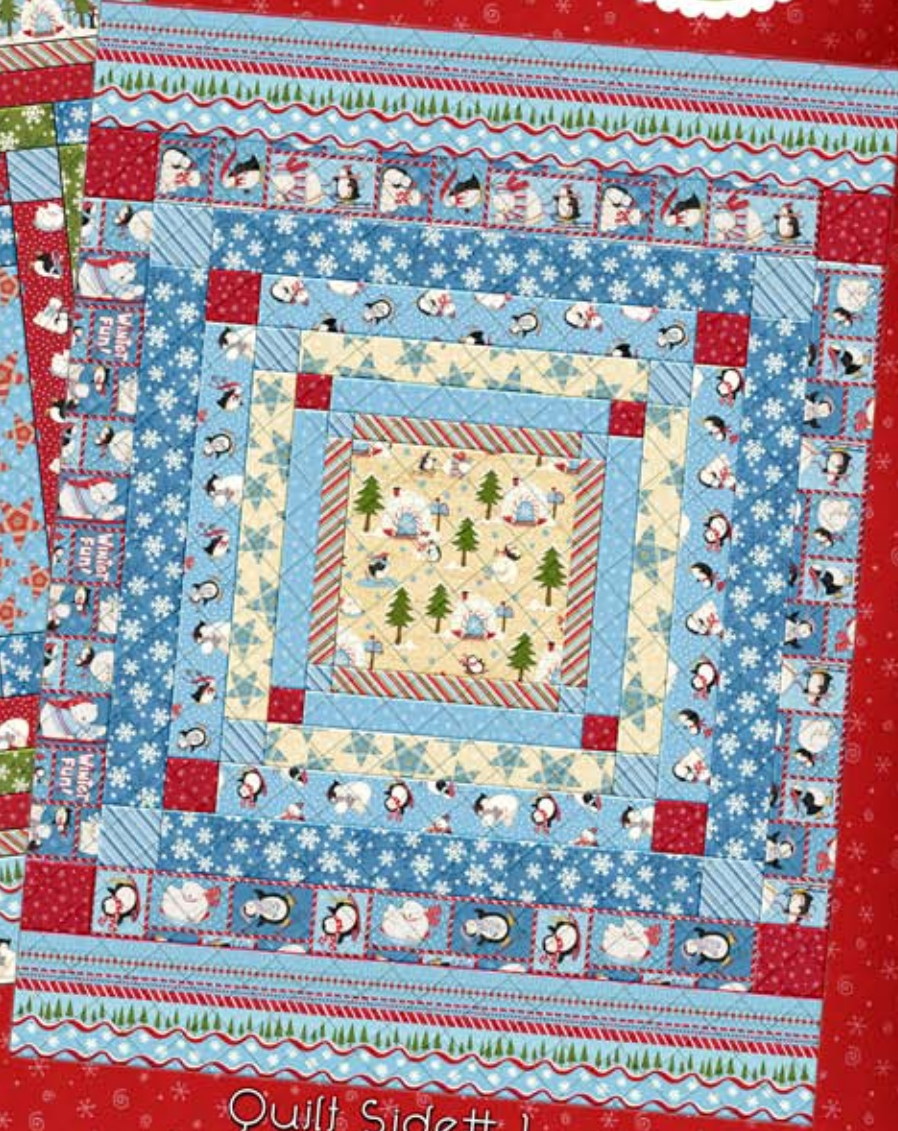
Quilt Side# 1