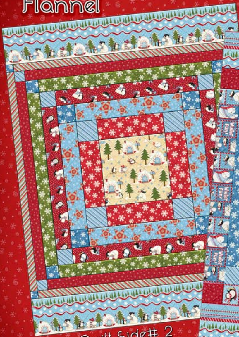
Quilt Side# 2