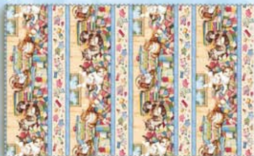
Fabric B - 33552-247 TB- 1 yard