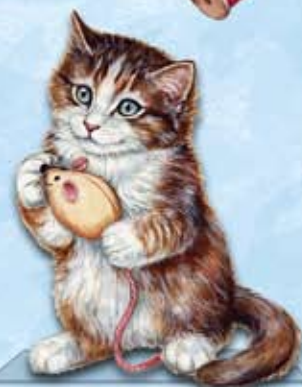
Q550-77-550 "Quilting Purr-fection" Project Sheet - Pack of 12