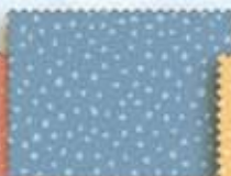
Fabric M 31073-444 1 1/8 yards (incl. binding)