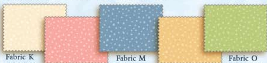
Fabric K 31073-111 1 1/8 yard

Q1875 - Studio Coordinates (used in Quilt only):