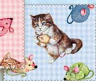
Fabric E - 33555-421 Q- 3 1/4 yards (backing only)