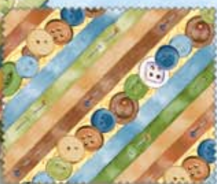
Fabric J - 33558-522 TB- 2/3 yard

Q1875 - Studio Coordinates (used in Quilt only):