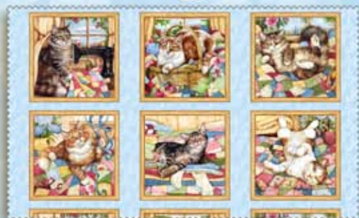
Fabric A - 33551-427 Q- 1 panel (2/3 yard)