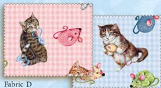
Fabric D 33555-321 Q- 1/4 yard