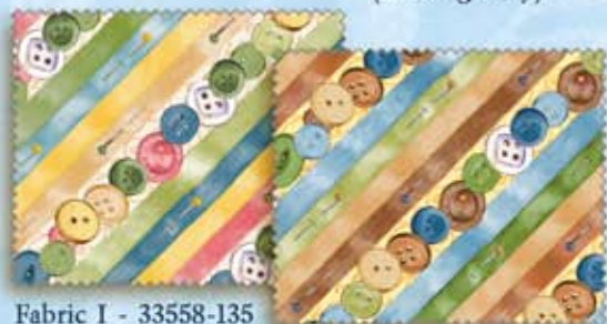
Fabric I - 33558-135 Q- 5/8 yard