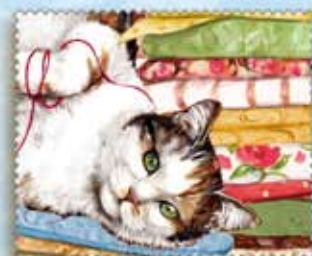
Fabric C - 33553-721 Q- 3/4 yard