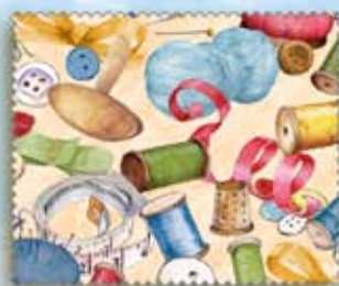
Fabric F - 33556-174 Q- 1/4 yard TB - 1 yard